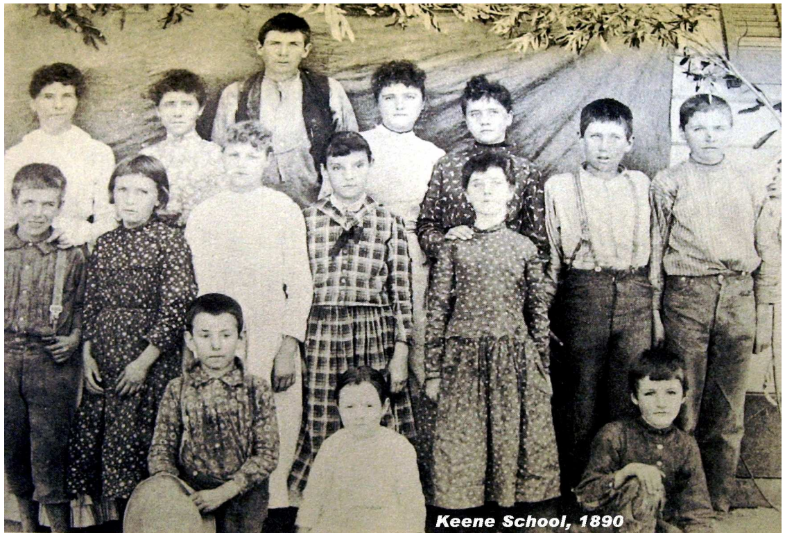
Keene School, 1890